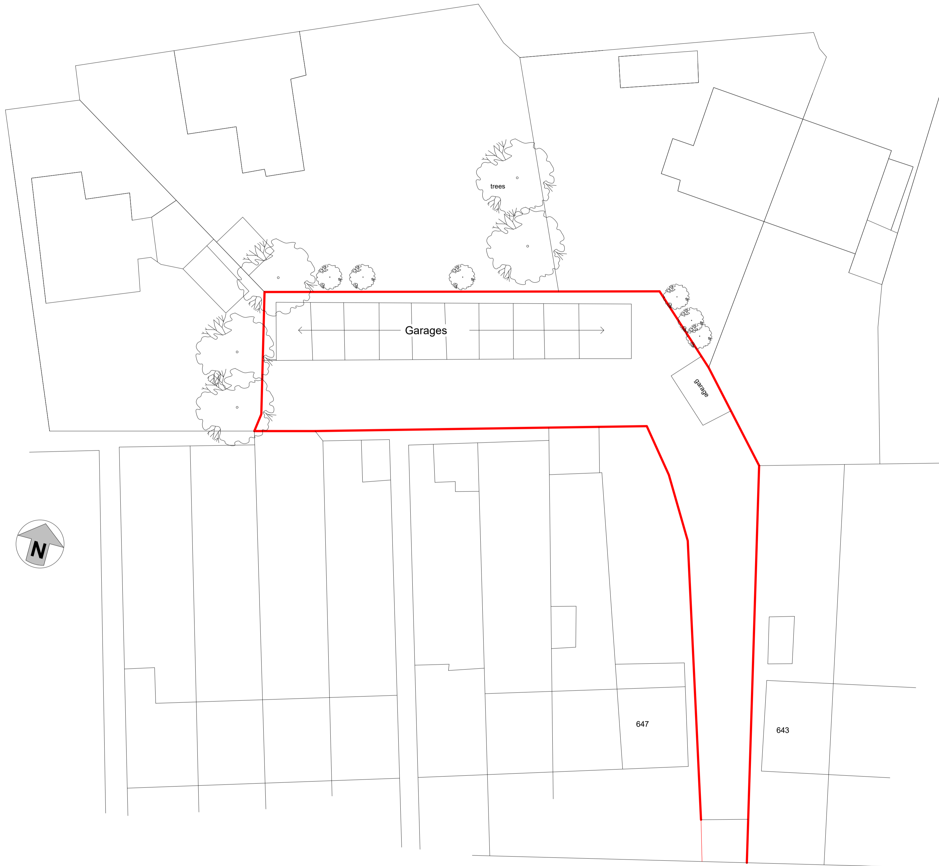
Site Plan Existing 1 : 200

All beam calculations (if applicable) as per separate sheet. All stated spans of beams on calculation sheet are clear spans only between supports. Contractor to confirm all spans on site and if applicable to add end bearings prior to ordering. Beams to cover full length of padstones.